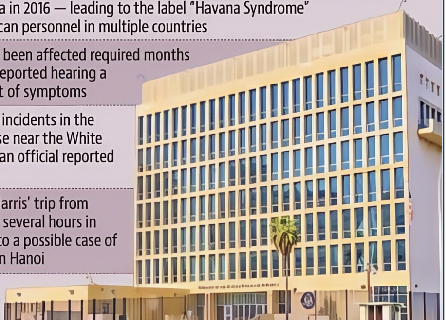
The US embassy in the city of Havana