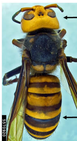
Asian Giant Hornet